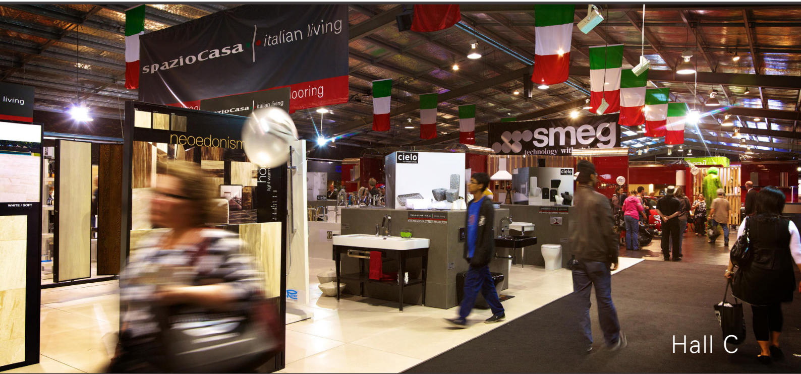
Hall C 2065sqm

We offer exhibition organisers the luxury of space and scope.