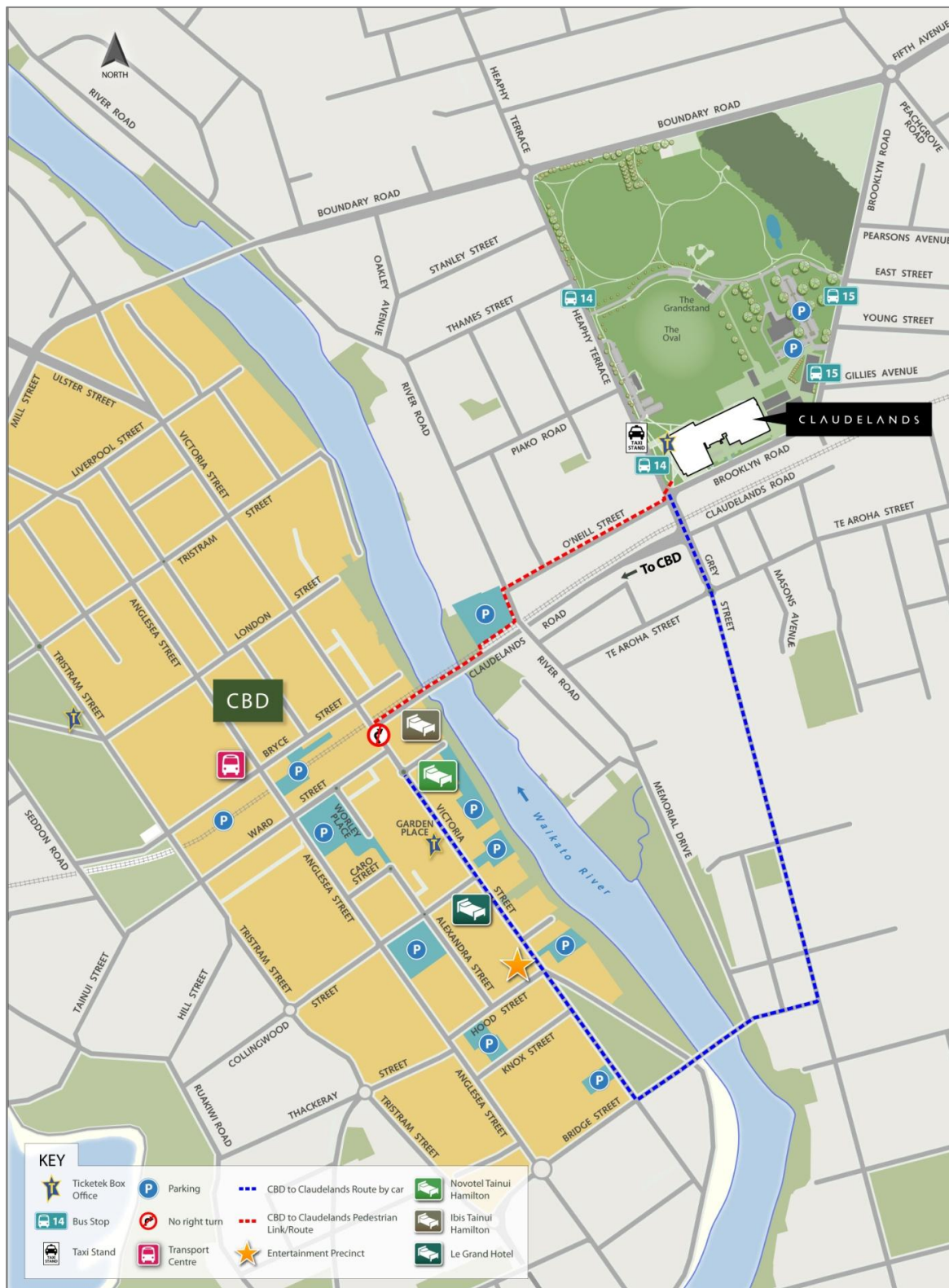
Map: Getting to Claudelands from the Central Business District

Download a PDF copy of this map and others at Claudelands Website